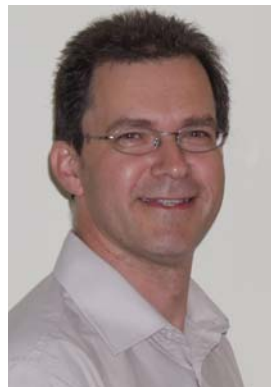
Paul Stapleton Day Services